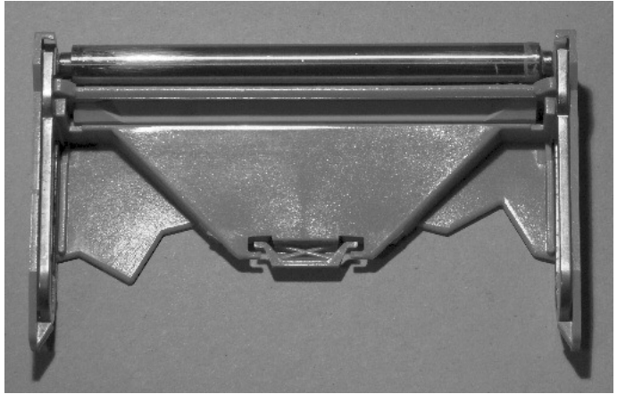
The roller assembly

http://shopus.polaroid.com/shop/public/products/details/dsp_product_details.cfm?product=618492